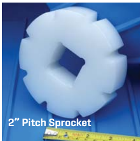
2" Pitch Sprocket