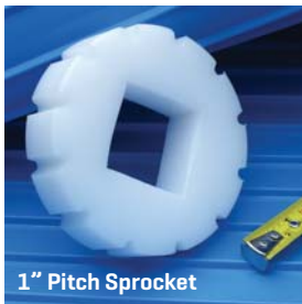
1" Pitch Sprocket

(1) Max allowable is set at the lower of 25% yield strength or 2% stretch at weld or splice