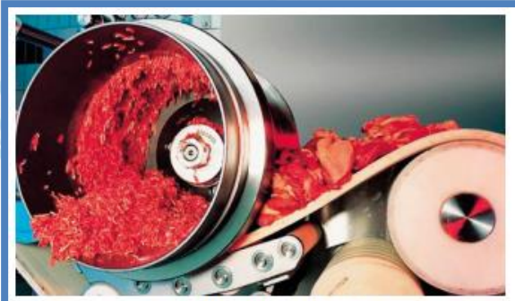
Picture 1: typical Deboning System

The belt pushes the product towards a rotating, perforated drum. Meat is gently pressed through the perforation of the drum and the other residues are scraped off the outer drum shell. This process enables the retrieval of food parts otherwise lost.